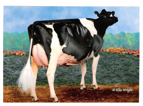
Crestomere Lou Victoria EX-94-2E 5* Daughter of Victory